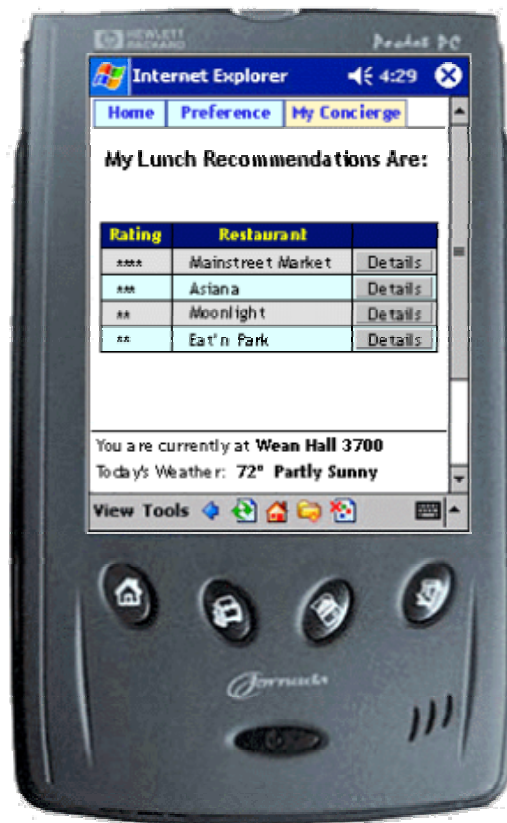
Fig. 2 This Restaurant Concierge is an example of a MyCampus Agent. It returns recommendations on where to have lunch, based on the user's current context and preferences (i.e. restaurant ratings are context and preference specific).

context-sensitive preferences (e.g. “when in class, I don't want to be disrupted by promotional messages) to decide which messages to show to the user.